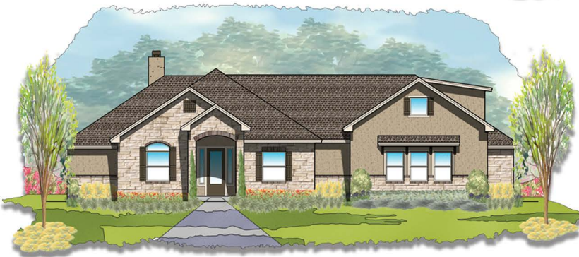
ELEVATION 'A - BONUS ROOM'