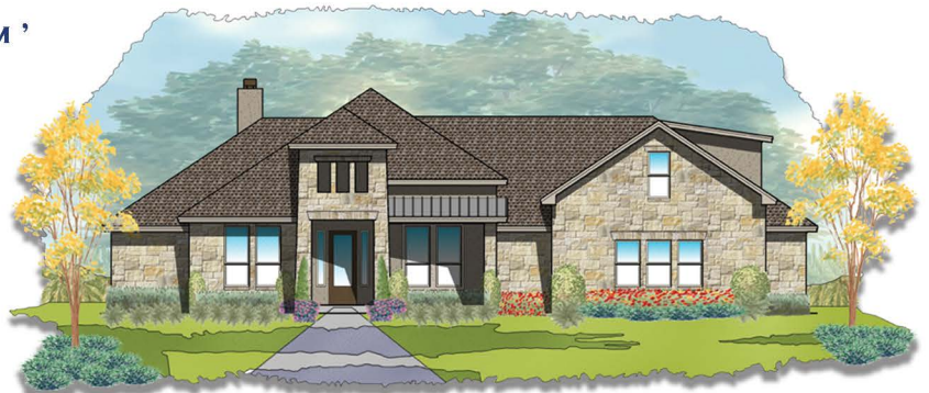
ELEVATION 'B - BONUS ROOM'

254.939.5100 OFFICE | www.CAROTHERSTX.com | FOURTH GENERATION HOME BUILDER