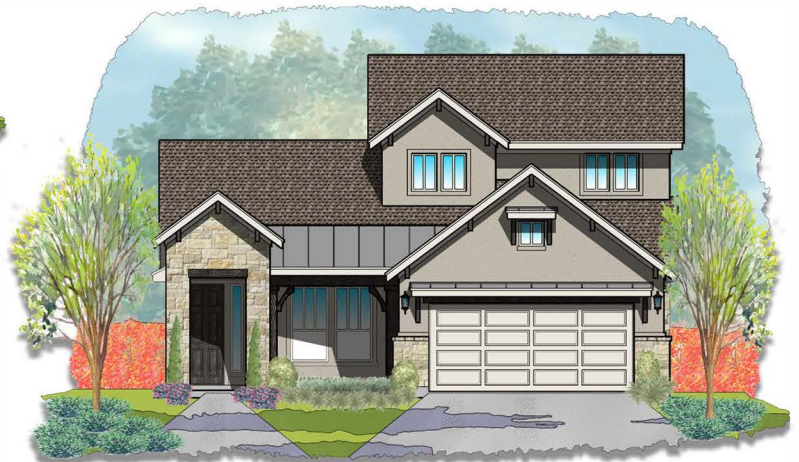
ELEVATION 'B' W/ SECOND FLOOR

254.773.0600 SALES LINE | www.CAROTHERSTX.com | FOURTH GENERATION HOME BUILDER