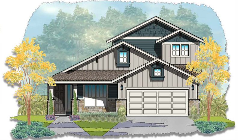
ELEVATION 'A' W/ SECOND FLOOR